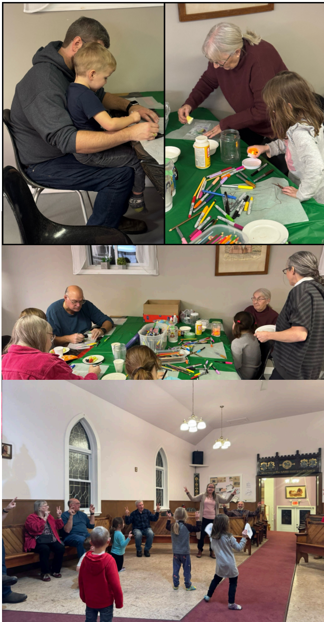
December 5 th - Parish of the Valley Messy Church at St. George's South Alice