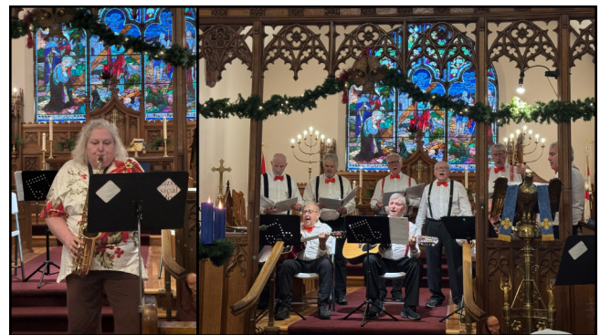
December 7 th - Christmas Pageant at Holy Trinity Pembroke